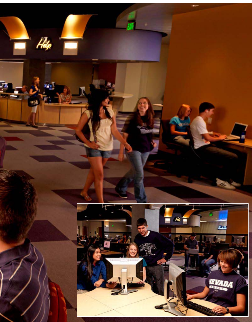
Students congregate to create, share and learn in the new @One, a multimedia study lounge in the Mathewson-IGT Knowledge Center.

a piece of carpet to stay pristine until the end of time.”